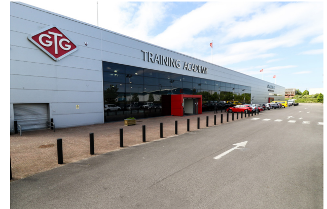
GTG West Midlands